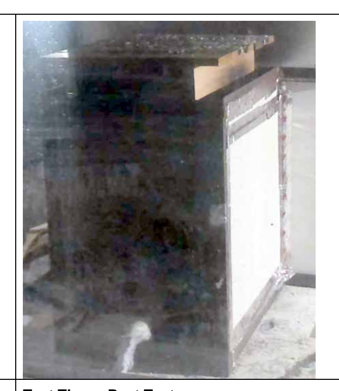
Test Three: Post Test